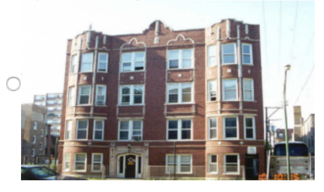
Street with high-rise buildings, without trees