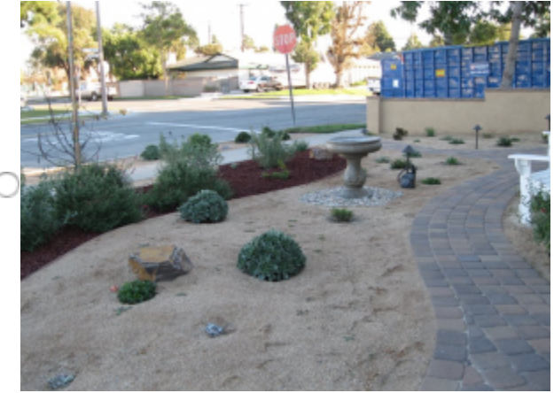
Suburban neighborhood without trees