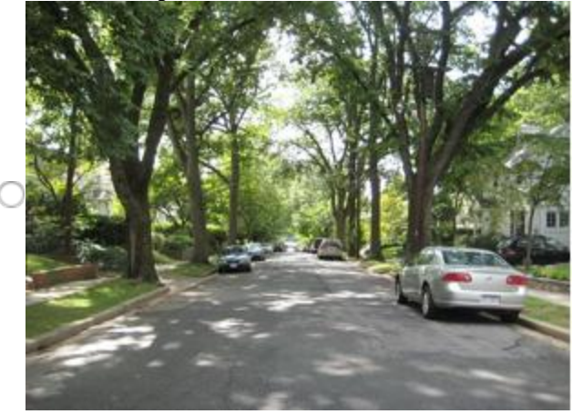
City neighborhood with trees