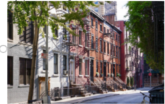
Street with high-rise buildings, with trees